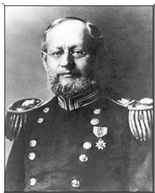
U.S. Army Major Henry Martyn Robert (1837–1923)