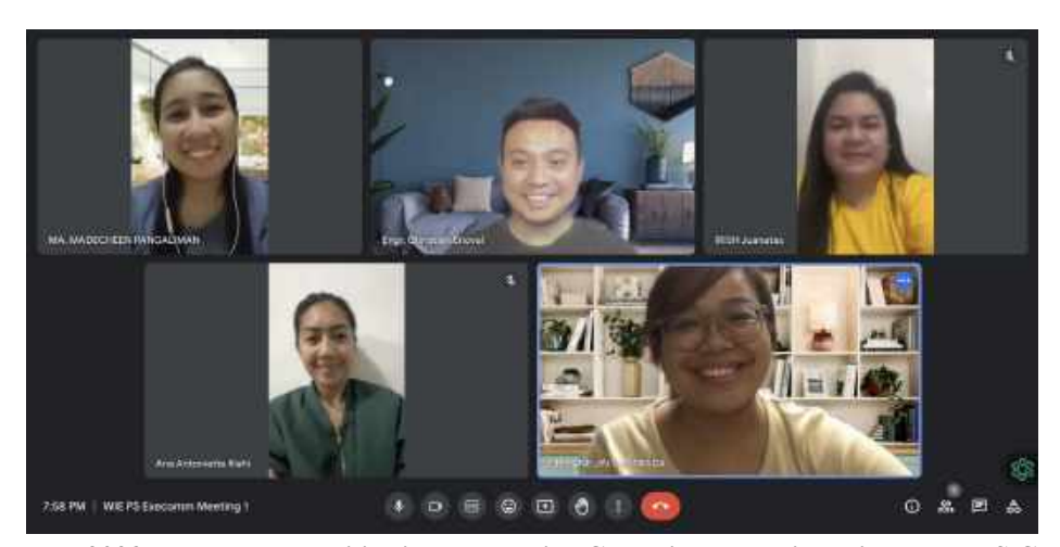
January 2023 - IEEE WIE Philippines Executive Committee Meeting with IEEE PS Chair