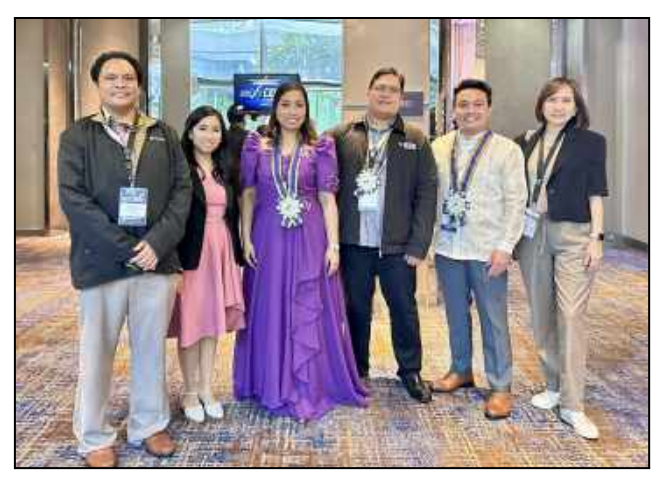
IEEE Philippines Section officers partnered some activities with the Institute of Electronics Engineers of the Philippines (IECEP), Inc. for year 2023 until 2024.