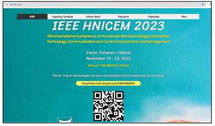
5th International Conference on Humanoid, Nanotechnology, Information Technology, Communication and Control, Environment, and Management