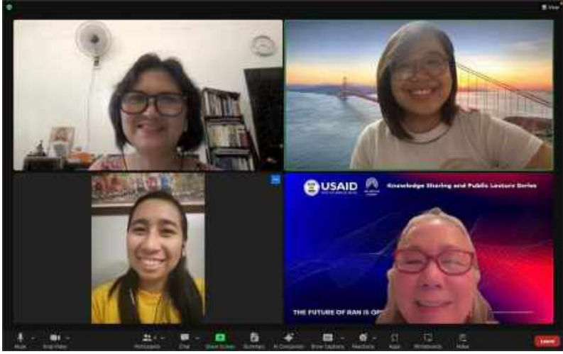
February 23, 2024 - The IEEE WIE Philippines Section officers met with the AORA team last Friday,, to explore potential partnerships and upcoming events.