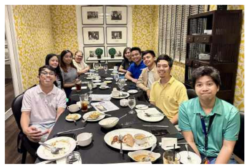
December 5, 2023 - IEEE PS Christmas Dinner and Year End Meeting

IEEE Social activities (Family day, IEEE day, Engineers Week)"