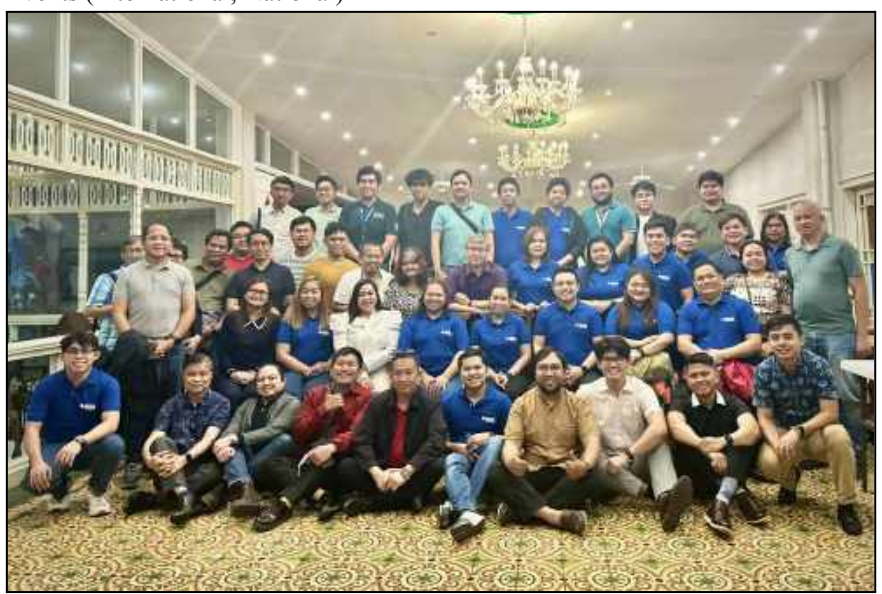
IEEE Philippines Section General Membership Meeting