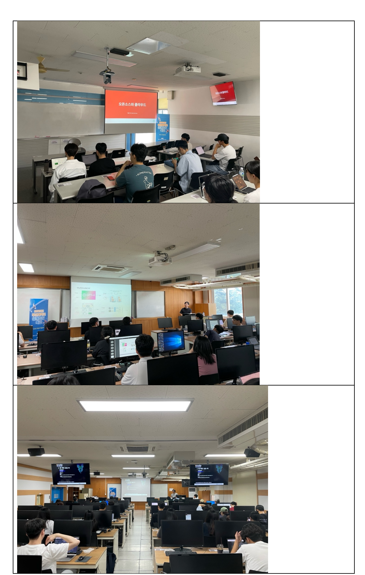
B.4 Students Activities