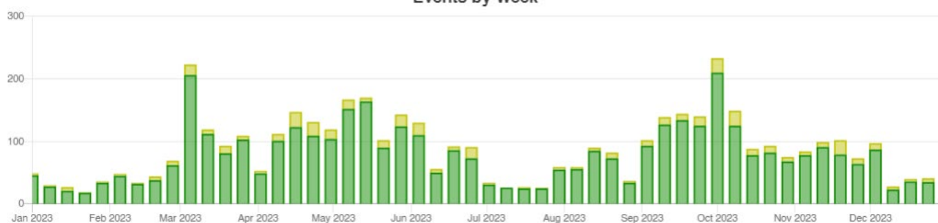
Events by Week