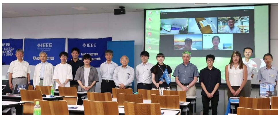
EA event “Learn cutting-edge-technologies in English”