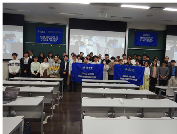
WIE Symposium 2023